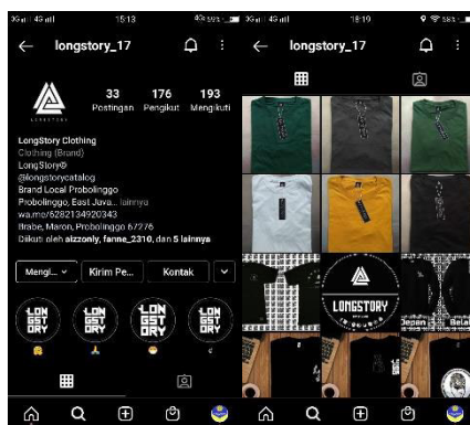
Figure 1. Longstory Clothing Online Store