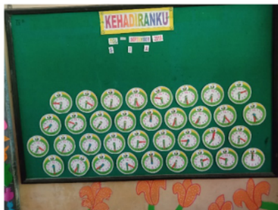
Fig. 3: Flannel board types of visual learning media. (D, GrA, 1)

Based on the triangulation of sources and techniques, it can be concluded that the research findings on what activities use