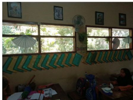
Fig. 5: Media portfolio map stores student portfolio results. (D, GrA, 3)

To strengthen the results of the interviews, the data collected from the documentation results in the form of photos of the portfolio map to store the portfolio works of the VA class students as follows in Fig. 5.