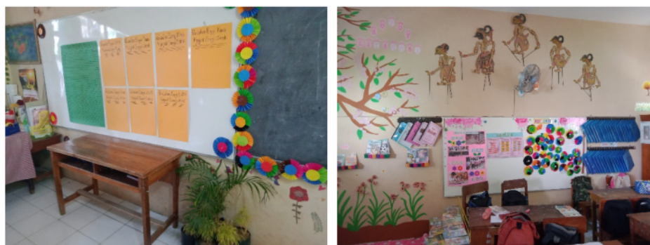
Fig. 4: Media display the results of student performance. (D, GrB, 2)