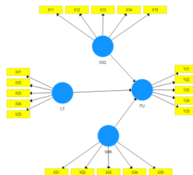
Fig. 1. Research Model